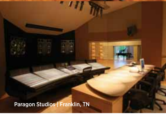
Paragon Studios | Franklin, TN