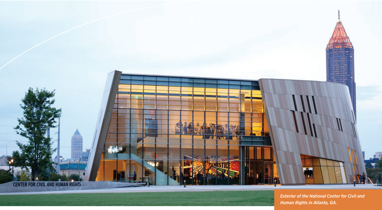
CENTER FOR CIVIL AND HUMAN RIGHTS