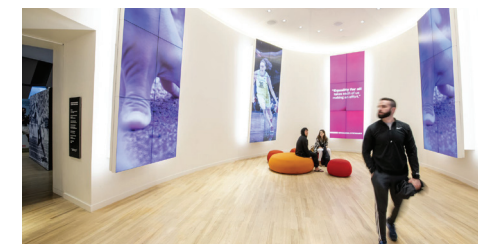
From left to right: Members of the Atlanta Falcons crossing the Edmund Pettus Bridge. View of The Center from the central walkway at Pemberton Place. Exhibits within The Center.